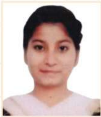
BARKHA Axis Bank Ltd (BCA)