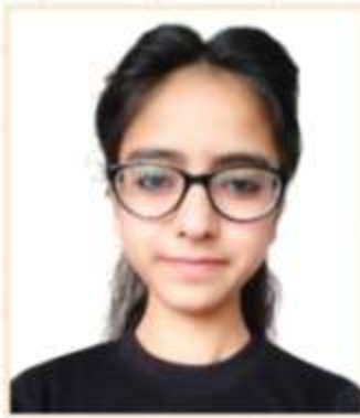
HARMAN BJS Home Delivery (MBA)