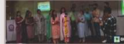
Department of Life Sciences & Allied Health Sciences organized One Day Seminar on "Aahar Kranti: Uttam Aahar, Uttam Vichar" on 15th May 2024 in collaboration with Global Indian Scientists and Technocrats (GIST).