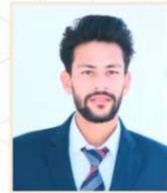
ADIL Decathlon (BPED)