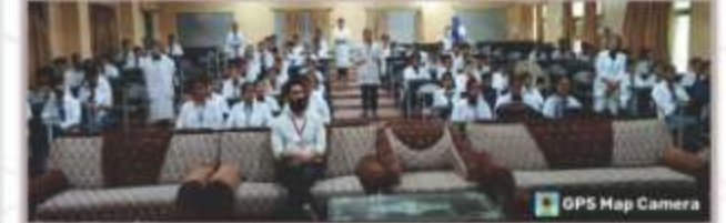
A Webinar on "Radiation Safety Training: Empowering Radiography Professionals" on 17th May 2024.