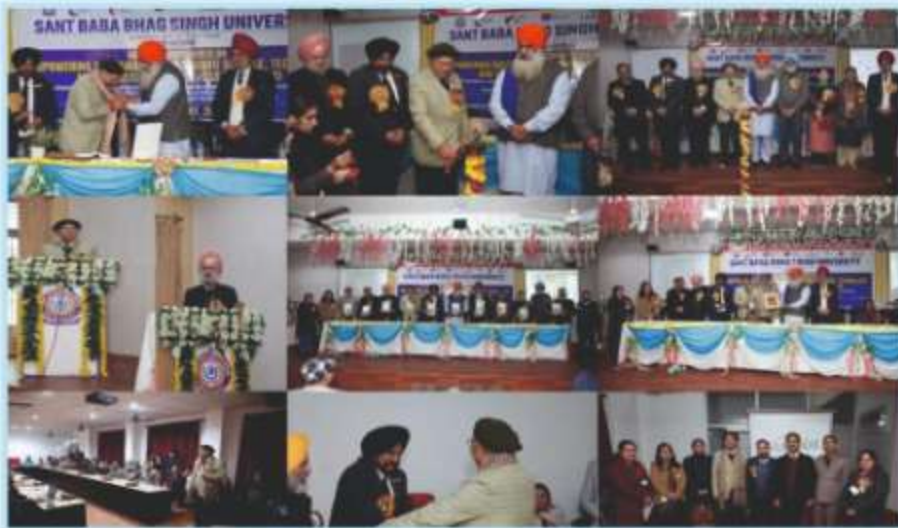
A DST SERB & PCB sponsored 3-day National Conference entitled "Empowering Sustainability: Bridging Science, Technology and Climate Resilience" was organized by the UIS on 17-19th Jan, 2024.